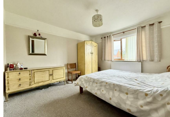
Bedroom 2 12'6 x 11'8 (3.81m x 3.56m)