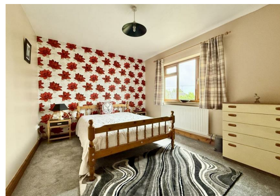
Bedroom 5 12'9 x 8'7 (3.89m x 2.62m)